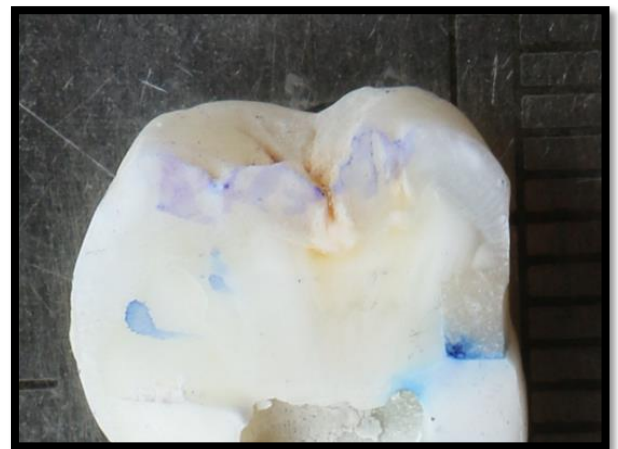
Fig 3: Group B: - Dye leakage viewed under Stereomicroscope.

Score 3 = Dye penetration along the occlusal/gingival wall to the full cavity depth and extending on to the axial wall.