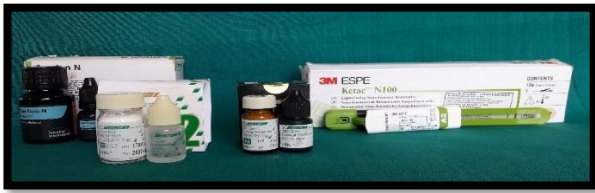
Fig 1: Restorative materials used.

In Group A: Chemically cured GIC, Group B: Light cured GIC, Group C: Nanofilled Resin Modified GIC, Group D: Cention N, were used as restorative materials. In Group E: Control Group in which no restorative material was placed into the prepared cavities. (Figure No:1)