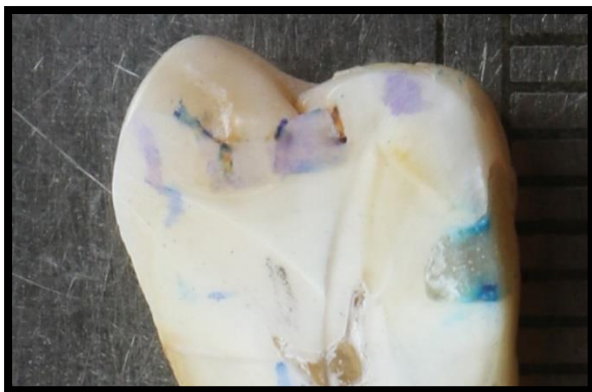
Fig 2: Group C: - Dye leakage viewed under Stereomicroscope.

The degree of marginal leakage was evaluated by the penetration of methylene blue dye from the occlusal and gingival cavosurface margins to the axial walls of the prepared cavities. Each specimen was viewed under a Stereomicroscope (M9, Wild Heerbrugg, Switzerland) at 10X magnification (Figure No:2 and Figure No:3) and scoring was done in 0-3 Scale scoring system as suggested by Silveira de Araujo. 6