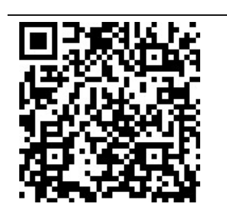
Keywords: complete denture insertion, stimulated salivary, Unstimulated