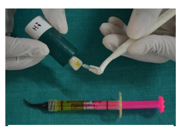
Fig-3: Application of hydro fluoric

from a distance of approx. 10 mm at a pressure of 5 bar(36 psi) for 10 seconds. This was followed by silane application, Primer application and bonding of the brackets using same criteria and materials as of group H samples. All the specimens were stored in distilled water for 1 weekat 37.8 ^{\circ} C. This was followed by thermocycling of specimens 500 times between 5<sup>0</sup> Cand 55<sup>0</sup>C with a dwelling time of 30 seconds.