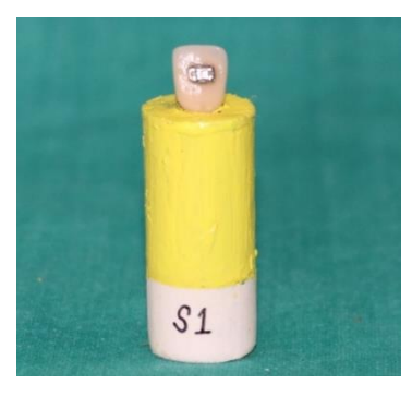
Fig-2: Group S

GROUP H: In group H the porcelain surface was etched with 9 percent buffered hydrofluoric acid (Ultradent porcelain etch, Ultradent product inc. South Jordan,Utah, USA) for 90 secondsaccording to product specifications (fig-3).The surface was then thoroughly rinsed with water spray and air dried, after that Silane(Ultradent product inc. South Jordan,Utah,USA) was applied to the porcelain surface and allowed to evaporate for 60 seconds, if not completely dry after 60