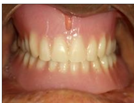
Fig 9: Final denture insertion

The denture was stable after all the movements. Aesthetics, phonetics and occlusion were assessed. Next denture fabrication was done in heat cure acrylic resin by conventional method. Finished, polished denture was then placed inside the patient's mouth after doing minor occlusal corrections. [figure. 9].