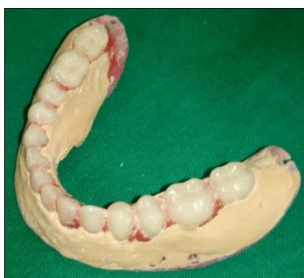
Fig 8: Intra oral re-confirming the teeth arrangement in neutral zone

The influence of perioral and oral muscle group were once again confirmed using low fusing zinc oxide eugenol. [figure. 8].