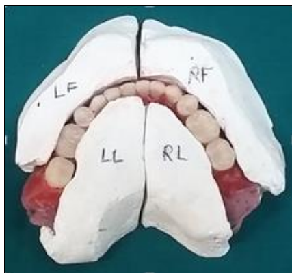
Fig 7: Teeth arrangement in neutral zone with plaster index

Locating grooves were cut on the master cast and indexing was done with type II gypsum product around the neutral zone impression on both the labial and lingual sides. The compound occlusal rim and acrylic stents was then replaced by flowing the molten wax in between the index to obtain wax rim in the neutral zone. Mandibular teeth arrangement was initiated in the neutral zone area then maxillary teeth were arranged according to neutral zone relation. Position of the teeth was checked by placing the plaster index together around the wax try in. [figure. 7].