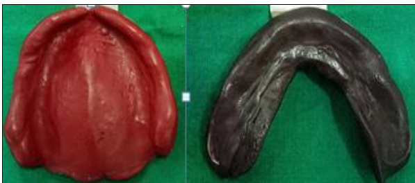
Fig 2: Maxillary and mandibular preliminary impressions

Preliminary impressions were made for both maxillary and mandibular arch in stock trays. Type I medium fusing impression compound for maxillary and admix method 3:7 ratio of medium fusing impression compound and low fusing green stick impression stick [Figure 2] which was further poured in Type II gypsum product to obtain diagnostic casts.