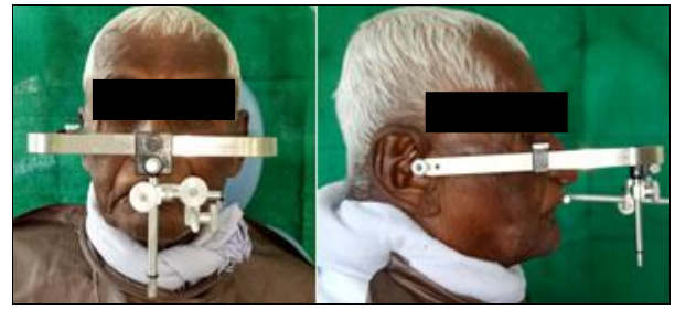
Fig 4: Face bow transfer

Hanau semi adjustable articulator using face bow [Figure 4].