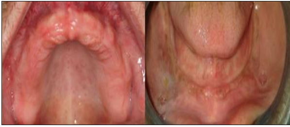
Fig 1: Intraoral photos of maxillary and mandibular occlusal view and front view

V shaped mandibular ridge. Due to excess resorption of alveolar ridge muscle attachments were higher and close to the residual ridge [Figure 1].