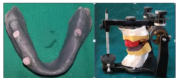
Fig 6: Neutral zone recorded

Maxillary rim was retained inside the mouth providing support to the facial muscle during making of neutral zone. Before starting with the neutral zone procedures, the patient shoulders were made relaxed with the head unsupported. Maxillary wax rim which was left inside the mouth was checked for support & occlusal plane. The medium fusing impression compound and low fusing green stick in ratio 3:7 (KERR) was softened in a 63 to 65°C water bath. The softened compound was properly kneaded and rolled over the attached acrylic stents on record base at recorded vertical dimension. Next to bring the muscle in action patient was asked to repeat series of actions like whistling, speaking, pursing the lips, swallowing, sucking, sipping water and slightly protruding the tongue out. These actions were performed repeatedly simulating physiological functioning. After 5 minutes, the set impression was taken out from the mouth. The neutral zone impression obtained was transferred on the master cast [figure 6].