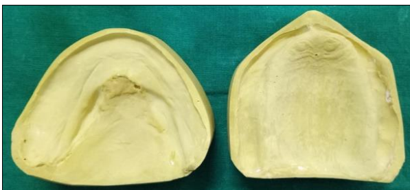
Fig 3: Maxillary and mandibular master casts

Impression was poured in Type III dental stone to obtain master casts [Figure 3].