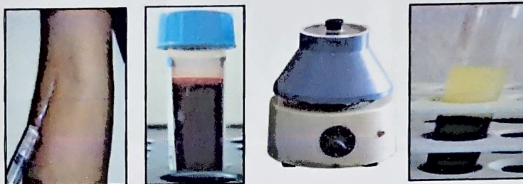
WITHDRAWING OF PATIENT'S BLOOD CENTRIFUGAL MACHINE AFTER CENTRIFUGATION

The PRF was prepared in accordance with the protocol developed by Choukroun et al 19 . Intravenous blood (by venipuncturing of the antecubital vein) was collected in a 10-ml sterile tube without anticoagulant and immediately centrifuged in centrifugation machine at 3,000 revolutions (Approximately 400 g) per minute for 10 minutes. Blood centrifugation immediately after collection allows the composition of a structured fibrin clot in the middle of the tube, just between the red corpuscles at the bottom and acellular plasma (Platelet-poor plasma) at the top 20 . PRF was easily separated from red corpuscles base [preserving a small red blood cell (RBC) layer] using a sterile tweezers and scissors just after removal of Platelet-poor plasma (PPP) and then transferred onto a sterile dappen dish.